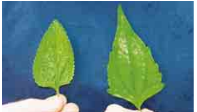
8. Billy goat weed leaf and Siam weed leaf