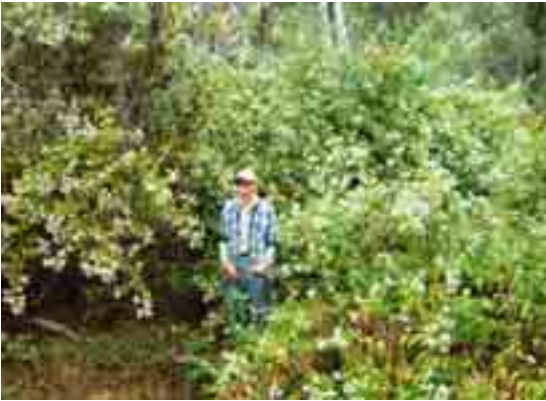
4. Growth habit