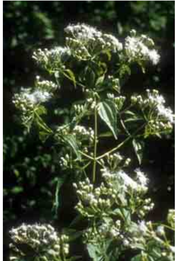
3. Mature plant

Siam weed ( Chromolaena odorata ) is considered to be one of the world's most invasive weeds and has the potential to spread across northern Australia and down both the eastern and western coastlines.