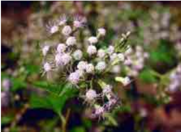
1. Mature flowers