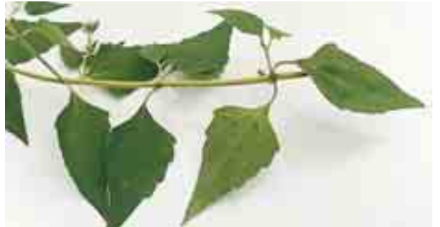
7. Siam weed stem