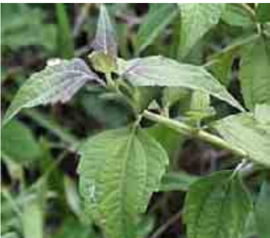
9. New growth