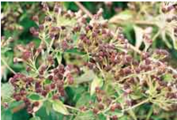
2. Flowers beginning to die – viable seed present