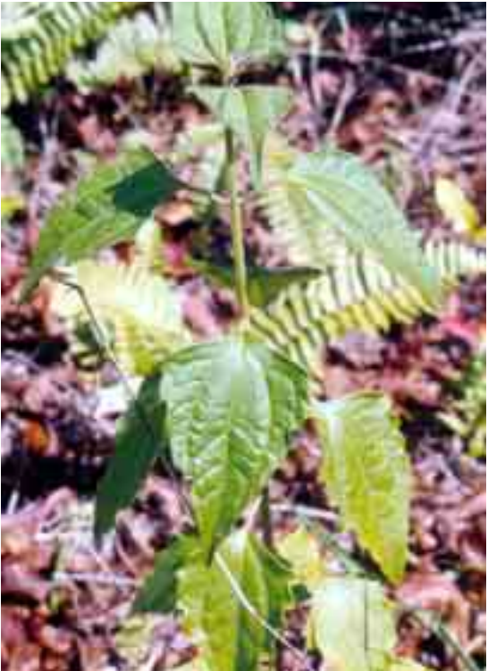
6. Seedling approximately 30 cm tall