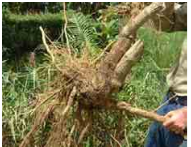
10. Basal ball

Fact sheets are available from NRW service centres and the NRW Information Centre phone (07 3237 1435). Check our web site < www.nrw.qld.gov.au > to ensure you have the latest version of this fact sheet. The control methods referred to in this Pest Fact should be used in accordance with the restrictions (federal and state legislation and local government laws) directly or indirectly related to each control method. These restrictions may prevent the utilisation of one or more of the methods referred to, depending on individual circumstances. While every care is taken to ensure the accuracy of this information, the Department of Natural Resources and Water does not invite reliance upon it, nor accept responsibility for any loss or damage caused by actions based on it. © The State of Queensland (Department of Natural Resources and Water) 2006