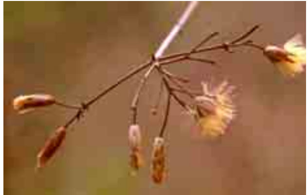
5. Seed head