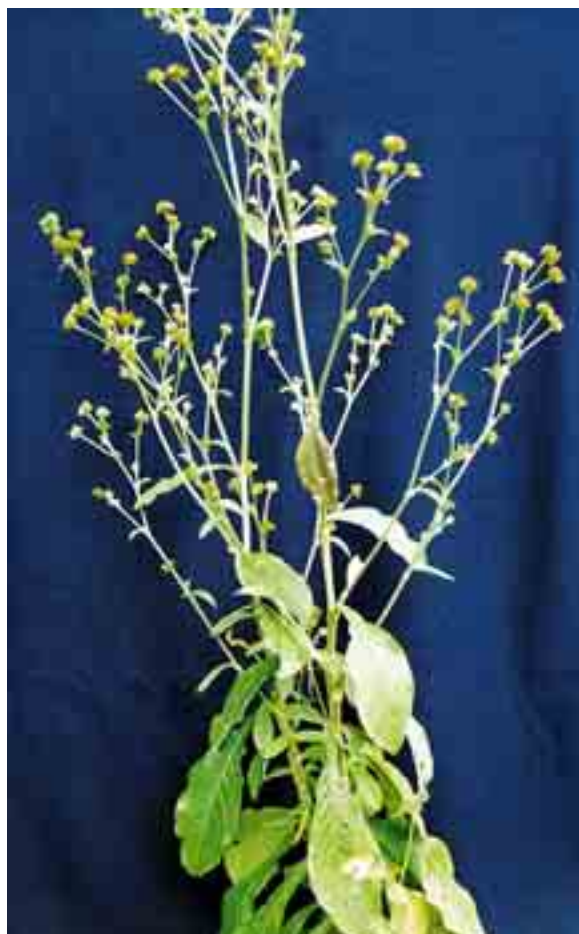
3. Mature plant