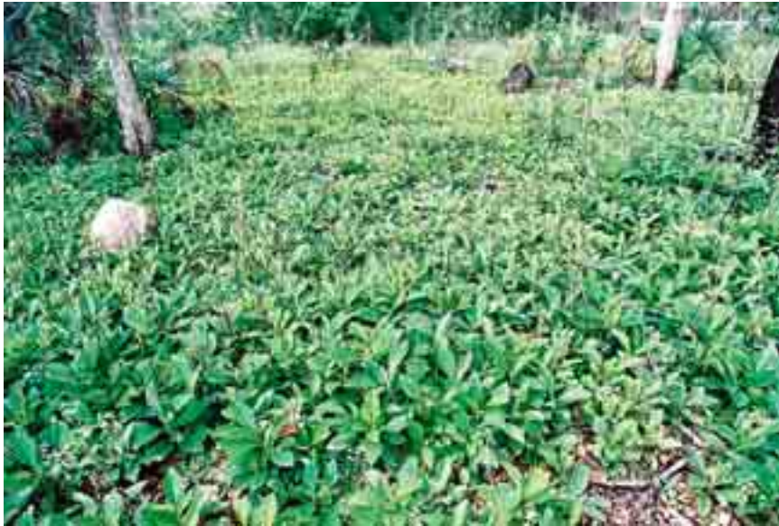
4. Seedlings smothering native vegetation