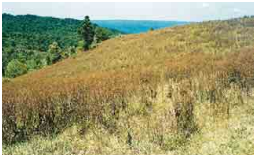
5. Pasture dominated by seeding tobacco weed