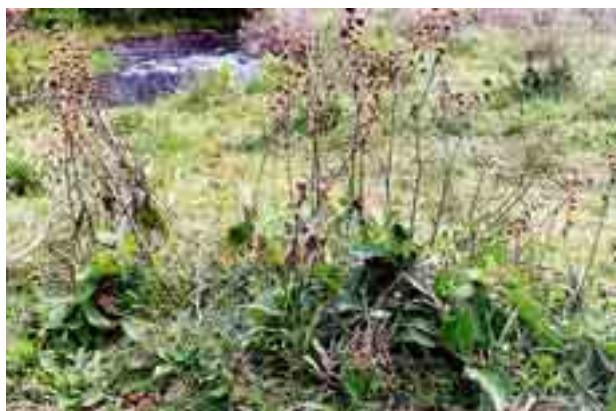
2. Plants in pasture near creek allowing seed to spread beyond the present infestation

Tobacco weed is a vigorous and aggressive weed and is regarded as a serious weed of agriculture in many wet tropical/sub-tropical countries.