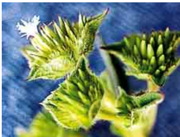
1. Flower seed head