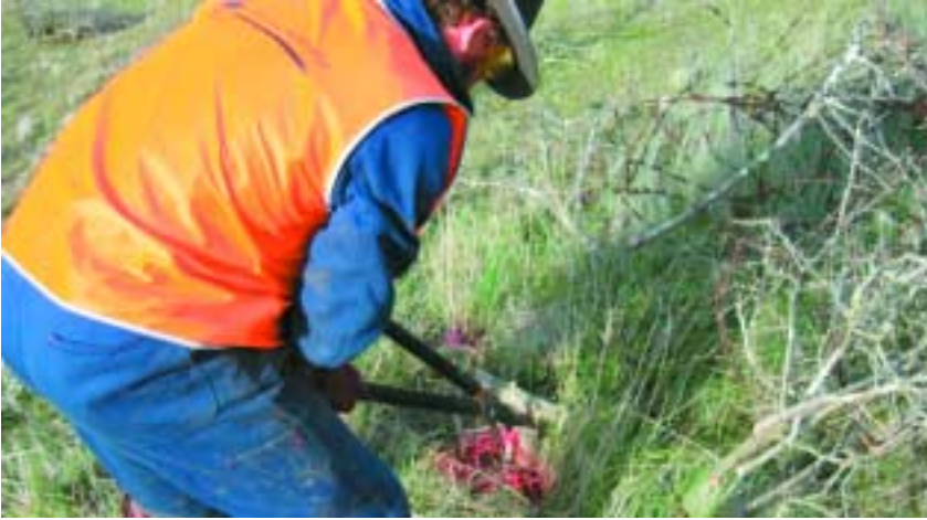
In the cut-stump technique, herbicides are painted immediately once the stem is cut as low to the ground as possible. A dye mixed with the herbicide can be useful as a marker.