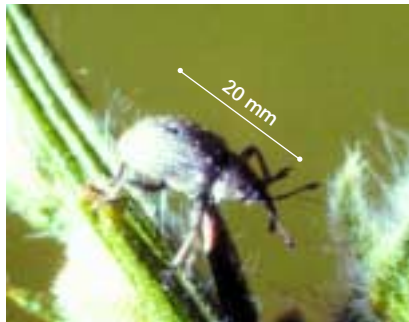
The gorse seed weevil ( Exapion ulicis ) was introduced into Australia in 1939 but its impact has been limited.

The gorse seed weevil Exapion ulicis was introduced into Australia in 1939 after being released in New Zealand. The grub stage of the weevil attacks gorse seeds. It is now widespread in Victoria and Tasmania but its impact has been limited because larvae feed only on seeds during spring and early