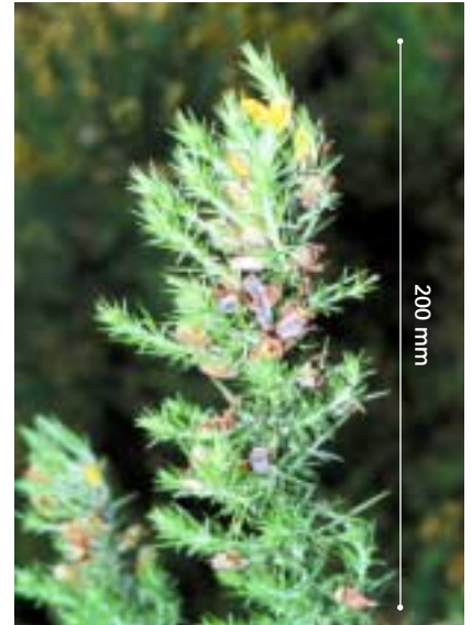
Gorse produces prolific numbers of seeds, up to 6 million per ha each year.

Based on climate suitability, gorse could potentially spread well beyond its current range. It could infest most of coastal southern Australia, including the whole of Tasmania, Victoria and the Australian Capital Territory, and most of southern South Australia. The relatively small Queensland infestation could also expand its range throughout the cooler, higher rainfall areas.