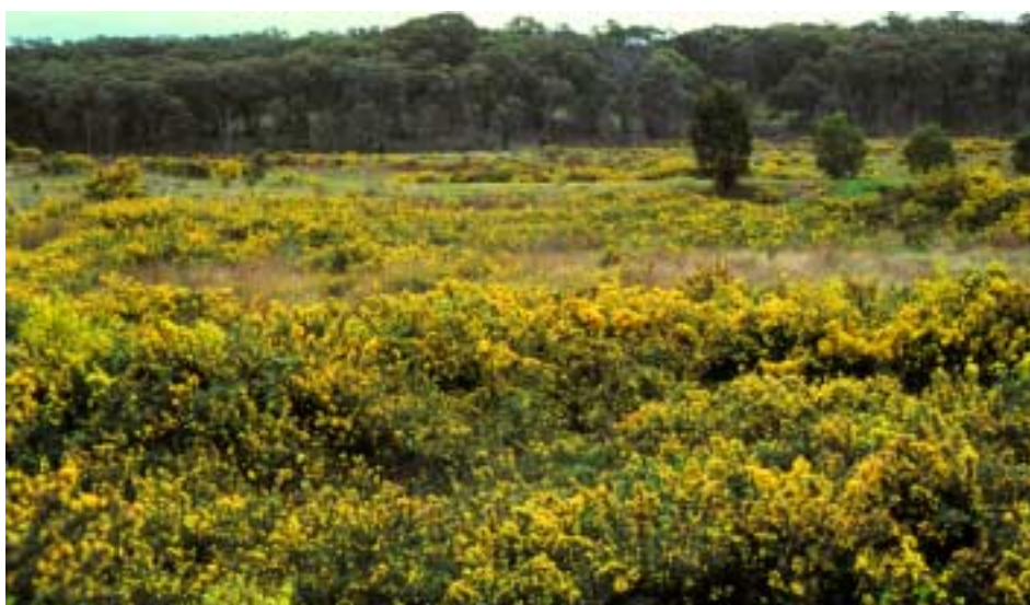
Gorse invades pastures and reduces primary production, often in association with other weeds such as Montpellier broom ( Genista monspessulana ): Smythesdale, Vic.

Gorse is a prickly, perennial, evergreen legume which, if left undisturbed, will grow to a height of more than 3 m. It produces deep and extensive roots. All