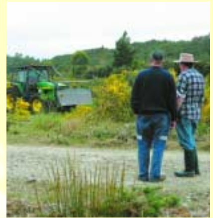
A gorse infestation in Zeehan, Tas, being mechanically cleared and mulched.

Good gorse control is difficult, with each situation needing to be assessed individually to determine the appropriate strategy.