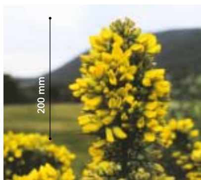
The bright yellow, pea-like flowers are mainly pollinated by bees.

Fire can also be useful in reducing dense thickets of gorse to ground level to allow follow-up spraying of regrowth. It will stimulate seed germination, allowing more seedlings to be sprayed the following year and reducing the seedbank.