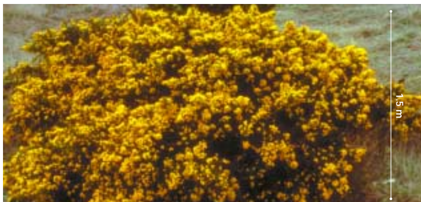
Gorse bushes are typically found up to 3 m tall and can flower year round under the right conditions.

In wasteland areas herbicides are often the only practical method, together with encouragement of native species regrowth.