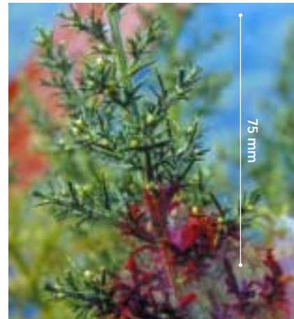
The gorse spider mite Tetranychus lintearius can appear as a reddish covering on a gorse bush.

In 1998 the gorse spider mite Tetranychus lintearius was released in Tasmania and Victoria. It forms colonies on the plant which spin a tent-like white web and move around the host plant as a group, feeding and web spinning as they go. These colonies feed on the leaves of mature gorse plants. By spring 2001 the spider mite had become widely established throughout most of the major gorse infestations in Tasmania and over large areas in Victoria. Although the mite is having an impact, it is being reduced by other mites and insects which feed on it and can destroy entire colonies.