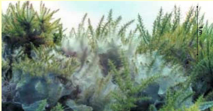
The spider mite forms colonies connected by a highly visible tent of silk webbing. It is well established in Tas and parts of Vic.