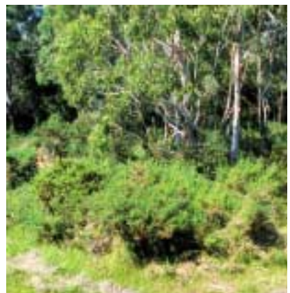
Gorse is increasingly becoming a threat as an environmental weed in many national parks and other bushland areas: Mount Lofty Ranges, SA.

Seed is usually carried into new areas in soil and mud attached to machinery or boots. All machinery, tools and footwear should be thoroughly cleaned after use in any gorse-infested area, especially in bushland and forests.